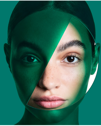
EXHIBIT SPACE OPTIONS & PRICING