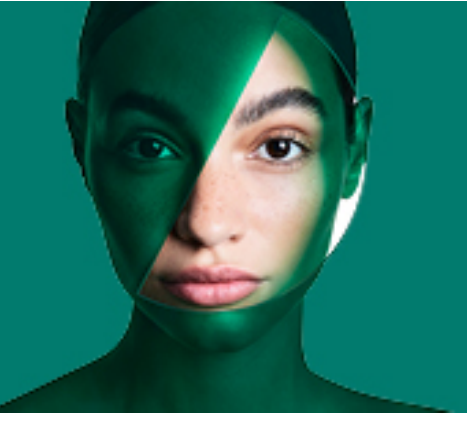
EXHIBIT SPACE OPTIONS & PRICING