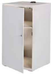
Pedestal, Powered Locking, White, 24"L 24"D 42"H