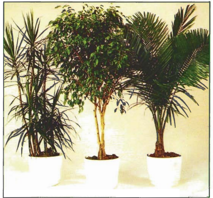
From left to right: Marginata, Ficus, Majestic Palm. Available in sizes 3' to 6'