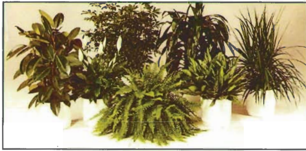
From left to right: Rubber Tree, Spath, Arboricola, Fern, Janet Craig, Silver Queen, Marginata. Available in heights from 2' to 3'.

Showplants offers a wide variety of greenery ranging in size to meet every need.