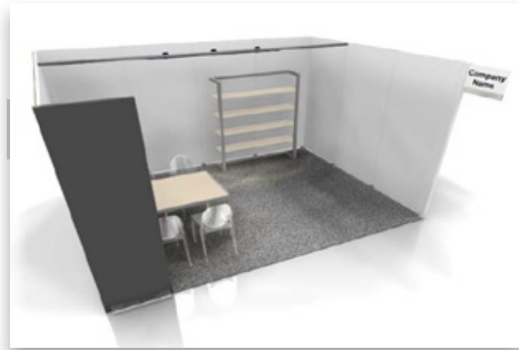
Picture is based on 12 sqm booth basic option