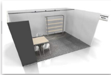
Picture is based on 12 sqm booth basic option

A NEW WORLD FOR BEAUTY BOLOGNA LAS VEGAS HONG KONG MUMBAI