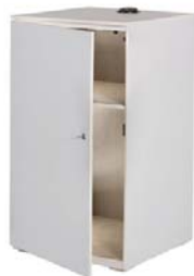
Pedestal, Powered Locking, White, 24"L 24"D 42"H