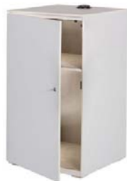
Pedestal, Powered Locking, White, 24"L 24"D 42"H